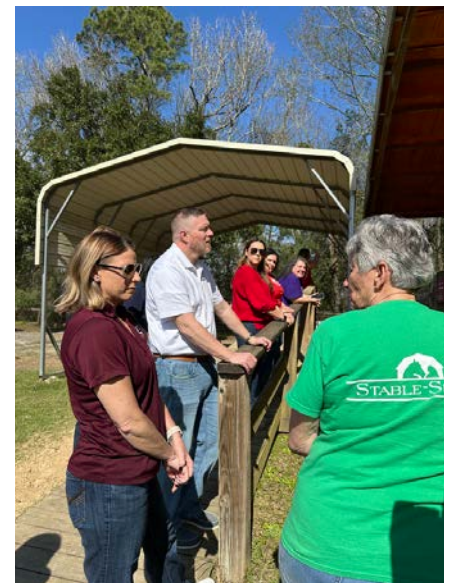
Board & Grant Committee at Stable Spirit Site Visit

*indicates member is serving their second term, and must rotate off the board or be a non-voting member for one year following