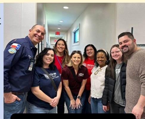
Grant Committee Site Visits

Top 3 Finalist: Recovery Council of SETX Samaritan Counseling Center United Board of Missions