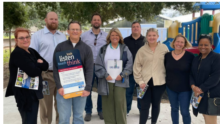
Born Learning Trail installed by Golden Pass LNG @ Shorkey