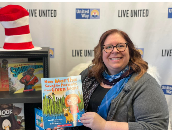
Virtual Reading Mentor