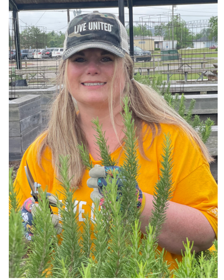
Fun @ the Garden