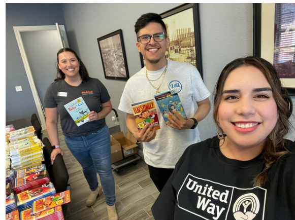
Summer Reading Palooza Team