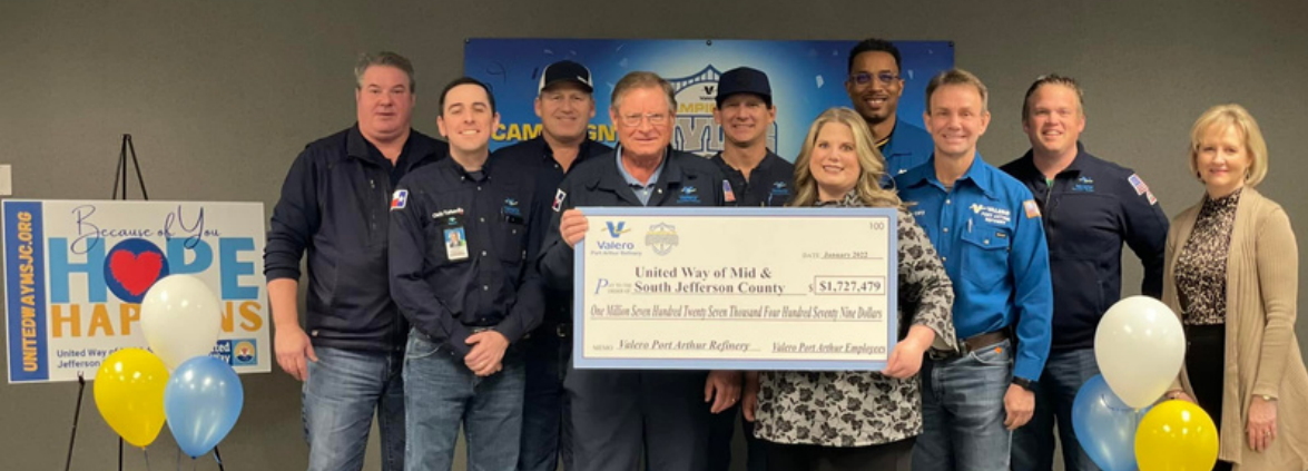
Valero Campaign Celebration