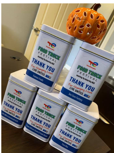
Food Truck Fest For Campaign